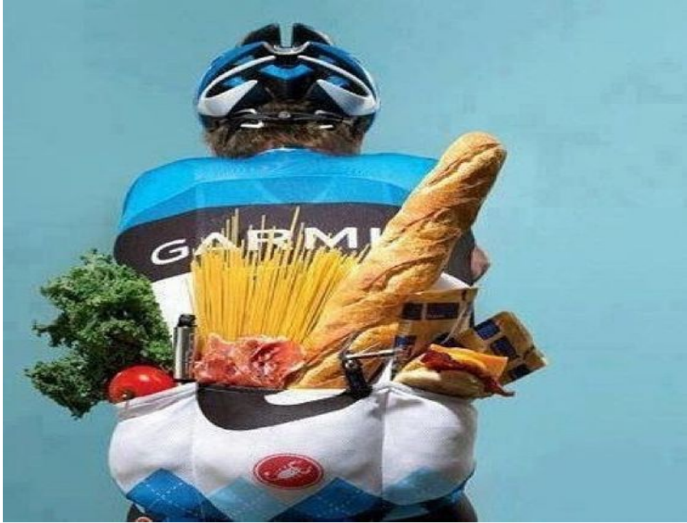
Biking to Farmer's Market